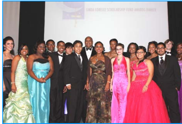
2009 LLSF Scholars

18th Annual Awards Dinner—September 11, 2010